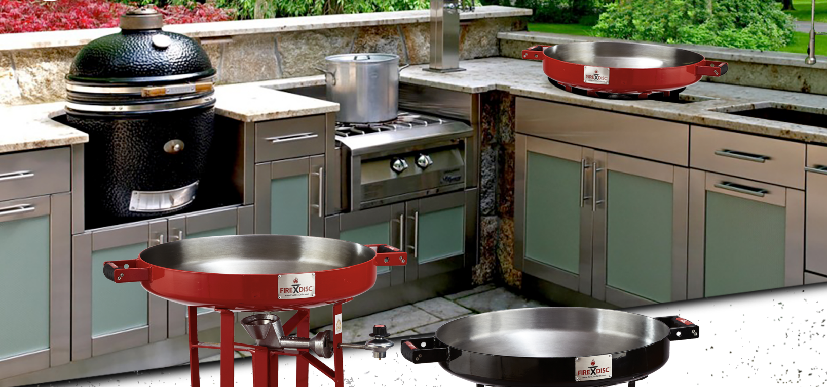
FIREDISC® DEEP™ 36-INCH IN FIREMAN RED